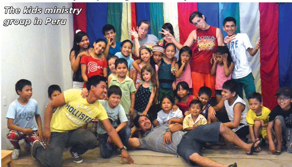
The kids ministry group in Peru