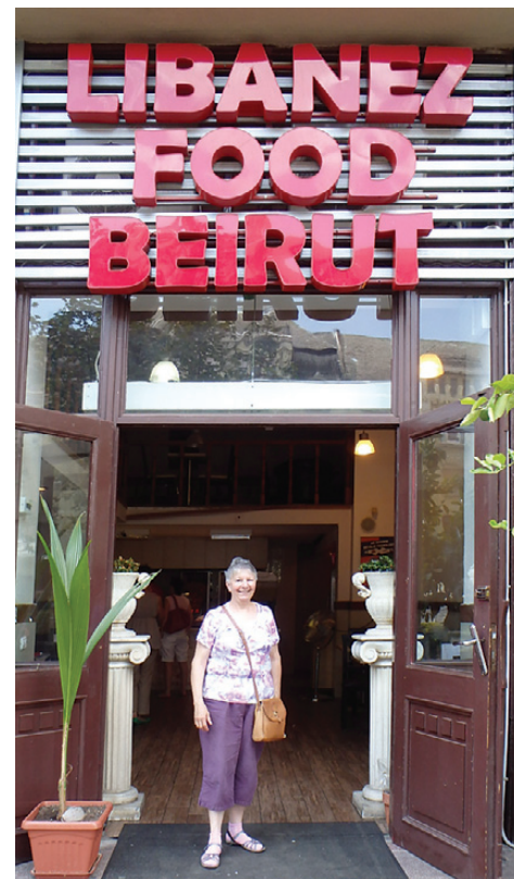
In front of a Lebanese restaurant in Timisoara, Romania