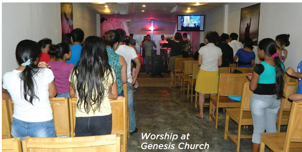
Worship at Genesis Church