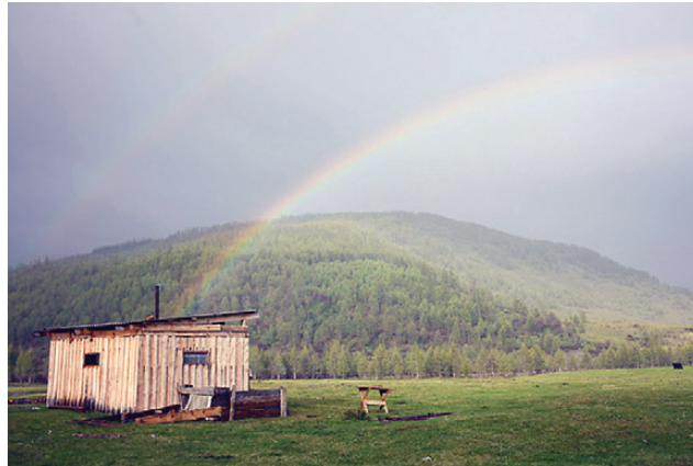
Dream home exterior and interior