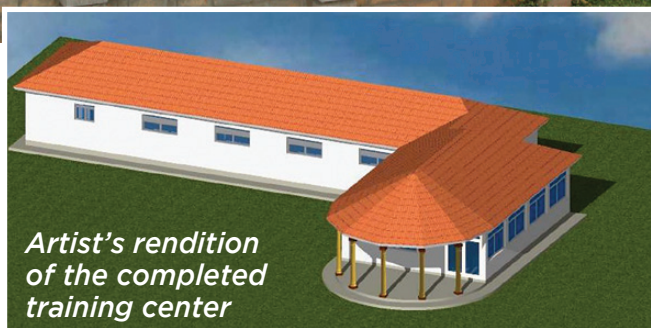
Artist's rendition of the completed training center