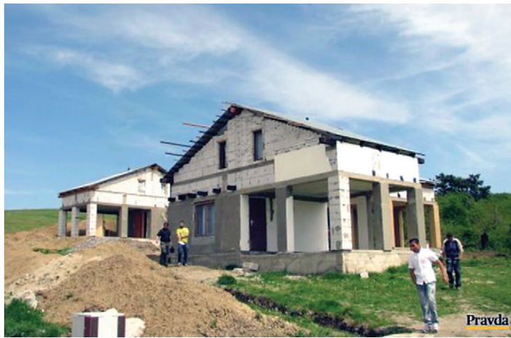
We partnered with a project building homes in Rankovce this past year.